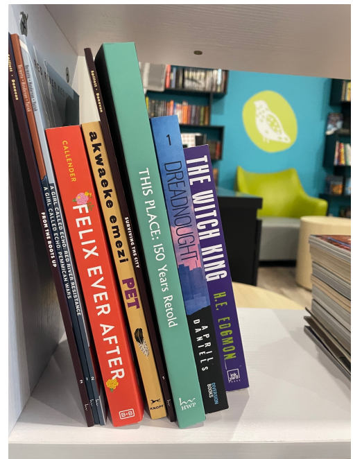
2SLGBTQIA+ books at Foundry Terrace (initial order)