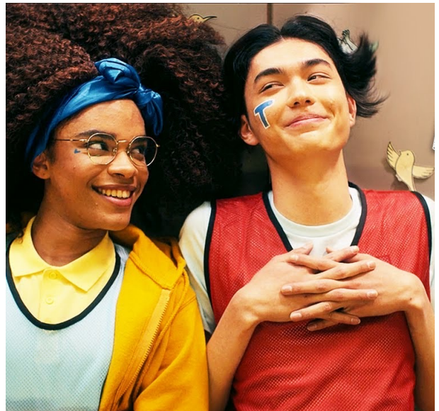
Elle (Yasmin Finney) and Tao from Heartstopper

The experience of trans joy guided this project. Our first meeting highlighted trans and two-spirit lives and accomplishments.